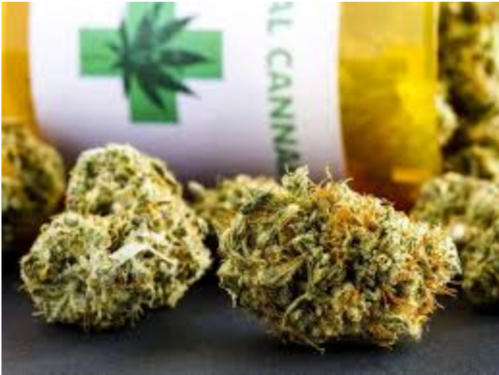
Trimmed marijuana buds